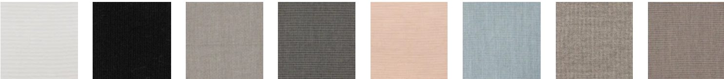
Canvas - Cat. B Black - Cat. B Panama Fossil - Cat. B Dark Smoke - Cat. B Blush - Cat. B Mineral Blue - Cat. B Carbon Beige - Cat. B London Stone - Cat. B