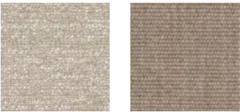
Gypsum - Cat C Fawn - Cat. B