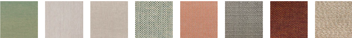
Olive Green - Cat. B Lin - Cat. B Almond - Cat. C Fig Green - Cat. C Coral - Cat. C Savane Zinc - Cat. C Spice - Cat. C Savane Coconut - Cat. C