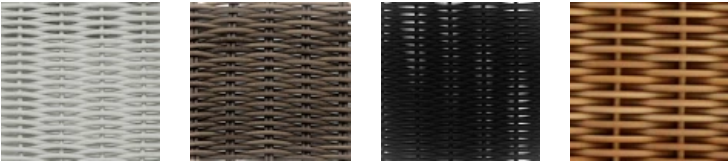
Old lace Taupe Black Honey

More information https://cotswoldfurniture.com.au/en/p/o/dining-chairs/edgard-dining-chair-teak-base